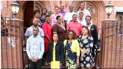
PRISON OUTREACH MINISTRY

The purpose of the Prison Outreach Ministry is to bring the light of Jesus Christ behind prison walls by positively impacting the under-served community of incarcerated men and women. Many people are not aware, but there are many opportunities within this ministry to actively get involved helping men and women behind bars or be a support system for their families. The Temple Of Restoration Prison Outreach partners with other organizations that have paved the way for churches to volunteer in areas to crack the infrastructure holding men and women in physical and spiritual bondage.