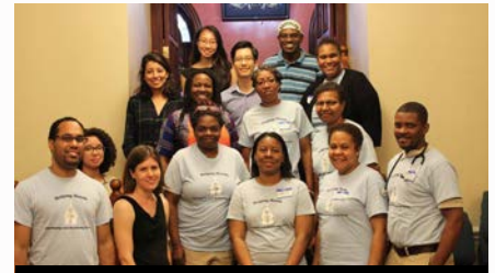
HELPING HANDS MINISTRY

Helping Hands Ministry is a faith-based social ministry of The Temple of Restoration. Faith-based social ministry refers to faith-based responses to social issues, linking faith to social responsibility. The mission of Helping Hands Ministry is to provide the community with social benefits that are based on biblical principles. Helping Hands accomplishes its mission via its community outreach programs. Our programs are based on biblical principles and focus on four areas: finance, health, family and youth enrichment. We minister to the “whole person” by addressing the social well-being needs of the community, in alignment with the evangelism outreach of The Temple of Restoration. We compassionately reach out to people in need and seek to change lives, empower people and transform our community.